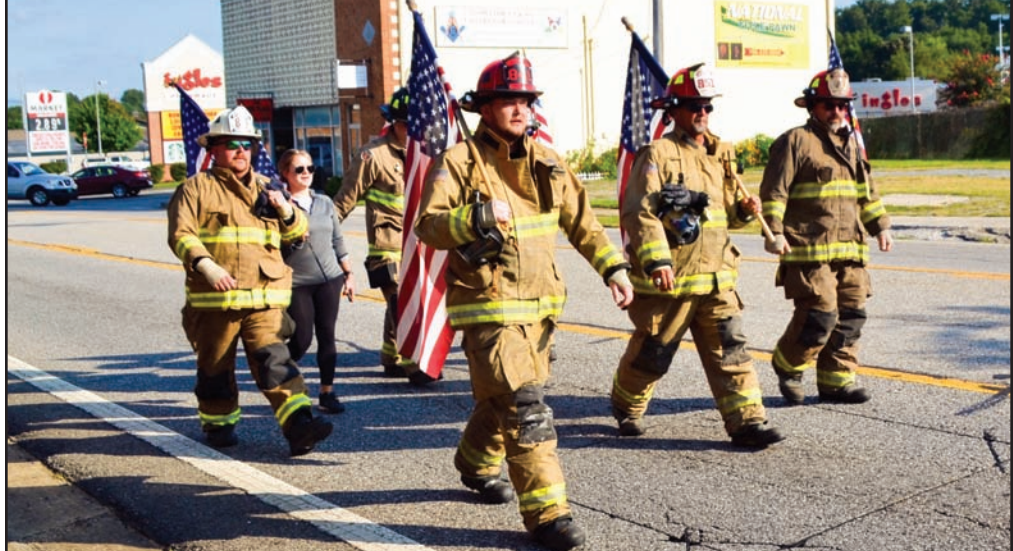
Towns County Firefighters commemorated their fallen brethren from Sept. 11, 2001, by walking in full turnout gear from the Georgia Mountain Fairgrounds to the Hiawassee Town Square for Saturday's remembrance.